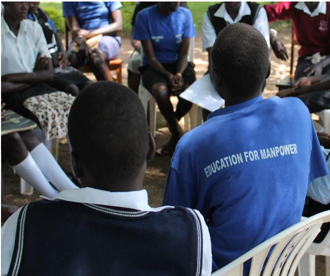
Youth engaging in focus group discussions.