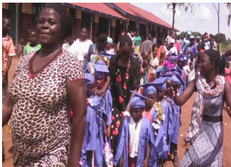
Refugee children of Panyadoli ECD with their parents and caretakers in graduation attire on 04 Dec 2018.