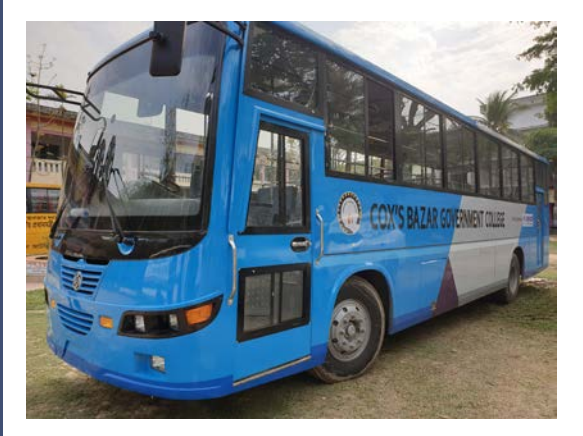
Student Bus for Cox's Bazar Government College

Project Brief: UNHCR provided student bus for about 1,200 out of 2,150 students at Ukhiya College who live in distant locations. The school, which is the oldest higher education institution in Ukhiya, supported the Rohingya refugee influx in 2017 by allowing its space to be used for humanitarian operation. The new bus ensures that students arrive safely and on time for the classes. College authority will maintain the facility and pay for the running cost of the bus service.