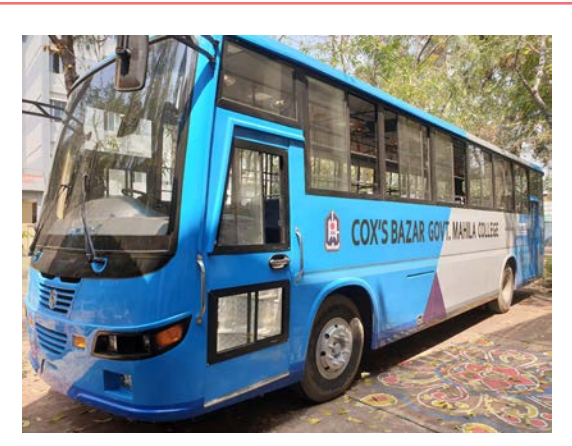
Student Bus for Cox's Bazar Government Mahila College

Project Brief: Cox's Bazar Government Mahila College is the biggest girls' college in Cox's Bazar district, currently hosting 2,353 students. More than half of the students live far away from the college and had to depend on public transportation. The college did not have transportation facilities and public transportation had become costly due to the refugee response operation. UNHCR provided student bus to help female students commute safely especially when travelling during night time. The bus maintenance and running cost will be paid by the college authority.