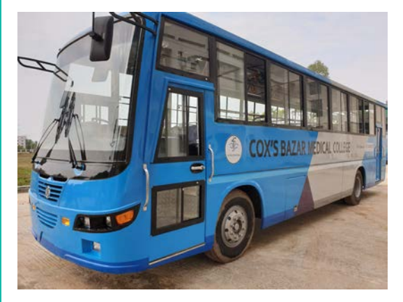
Student Bus for Cox's Bazar Medical College

Project Brief: Cox's Bazar Government College is the biggest public college in Cox's Bazar with 12,692 students. More than half of the students live far away from the college and had to rely on public transportation service, which was affected by the refugee crisis response. As a result, students often have to pay higher fare for public transport. UNHCR provided bus in addition to two buses already owned by the college, to ensure that the college students can commute safely. The bus maintenance and running cost will be paid by the college authority.