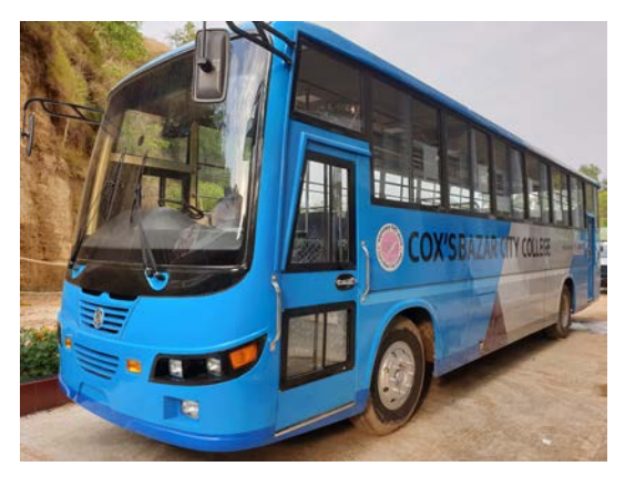
Student Bus for Cox's Bazar City College

Project Brief: UNHCR provided bus for around 7,000 out of 11,786 students currently enrolled in Cox's Bazar City College. The bus ensures that students can commute safely to the college, which is the biggest private college in Cox's Bazar district. The college authority will cover the maintenance and running cost of the service.