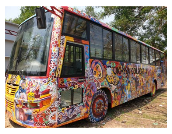
Student Bus for Ukhiya College