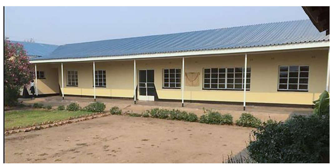
Administration block of the St Michael's Tongogara Secondary School