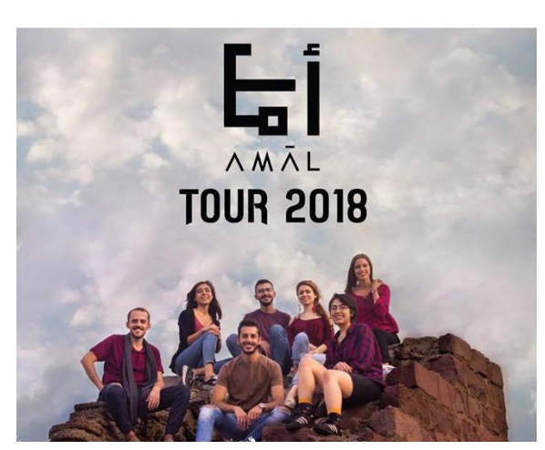
Amal Band gave five concerts in different cities of Turkey.

visual and moving. The play helped the Committee find talents among its members (Syrian, Iraqi and Turkish), be a role model to refugee children and develop positive relationships with the Turkish youth who joined them. The performance also had an impact on the refugees' families, who were very proud and touched. UNHCR also learnt that some family dynamics were changing progressively as a result of the play, especially regarding female performers and their freedom to participate in similar activities in the future. UNHCR will explore ways to continue to build on this experience with ASAM and the Youth Committee.