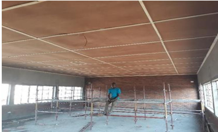
Laboratory construction at St Michael's Secondary School