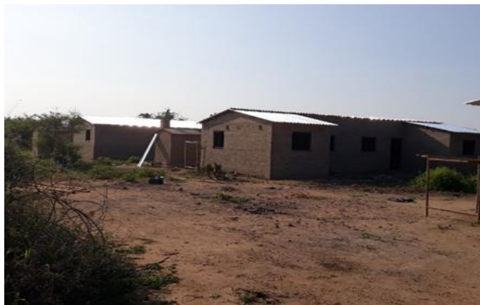
Refugee shelter construction