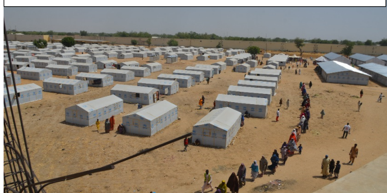
Some UNHCR provided shelters, New Stadium Camp in Maiduguri, Borno