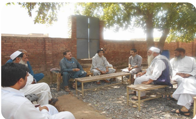
Meeting with community in Kababian RV @ Peshawar / Khyber Pakhtunkhwa