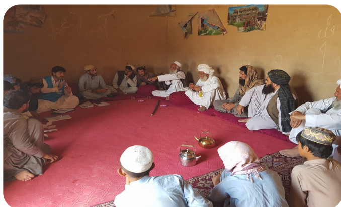
Community session in Chaghi RV @ Quetta / Balochistan