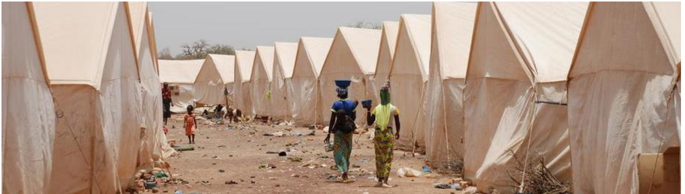
Barsalogo IDP site