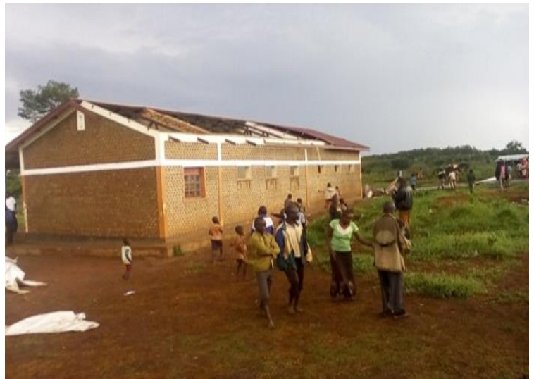
Storms caused the roof of Kinakyeitaka Primary School in Kyangwali to be blown off.