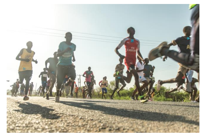
Refugee athletes compete in one of the 'We Run' athletics trial event in Kakuma refugee camp and Kalobeyei settlement.