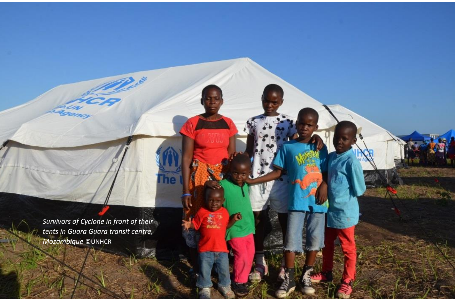
Survivors of Cyclone in front of their tents in Guara Guara transit centre, Mozambique