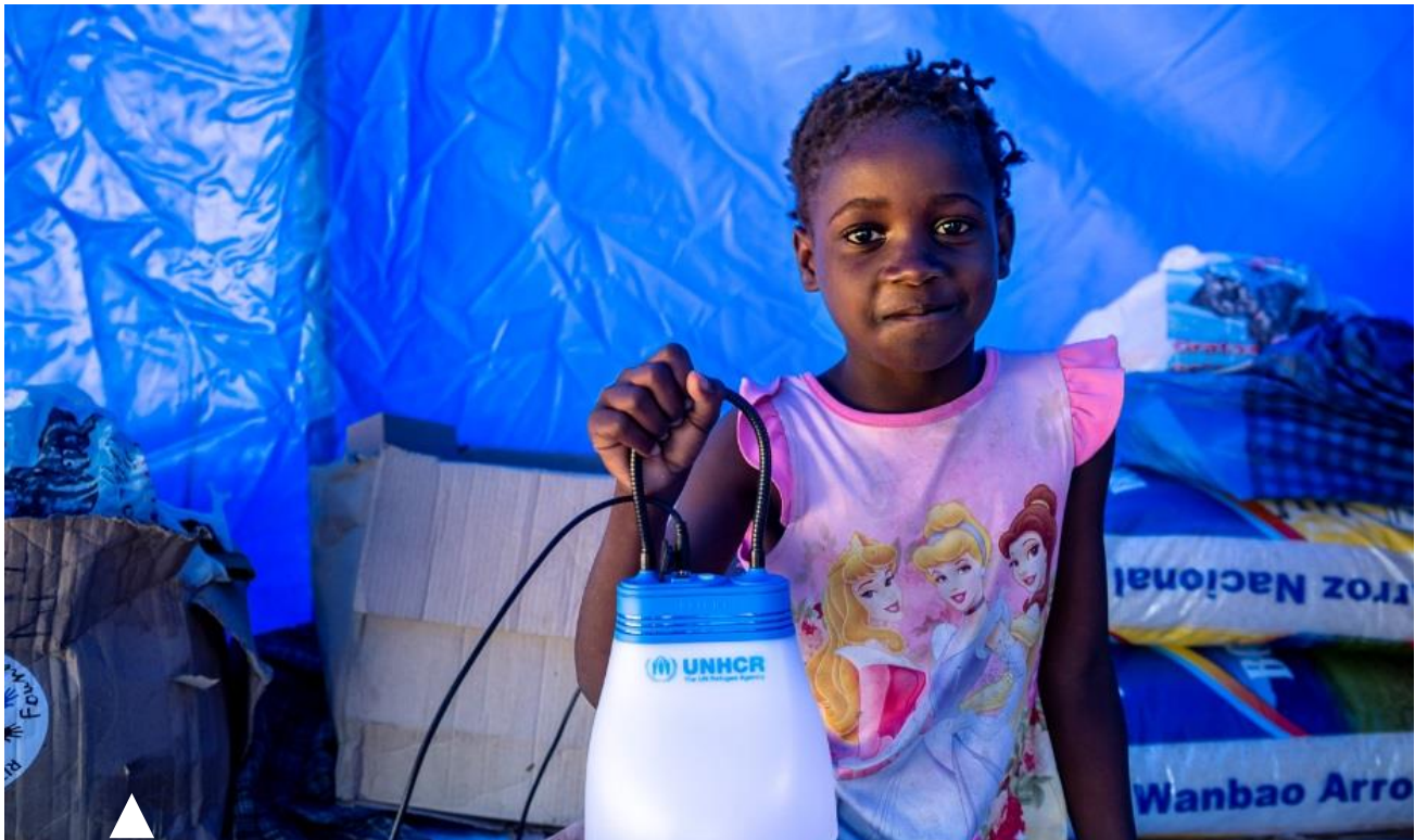
Displaced families take UNHCR solar lanterns back to their tents to charge, in Picoco camp, Beira, Mozambique

On 22 March, the UN Emergency Relief Coordinator activated an “IASC Humanitarian System Wide Scale-Up” in Mozambique for an initial period of three months. UNHCR subsequently activated its internal Level 3 emergency procedures for the Office’s response in the three countries, and facilitating the delivery of UNHCR’s commitments under the IASC scale-up protocols.