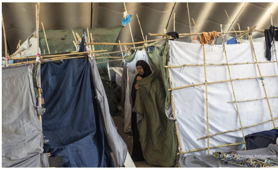
A refugee woman at the Pyli reception centre on the island of Kos.