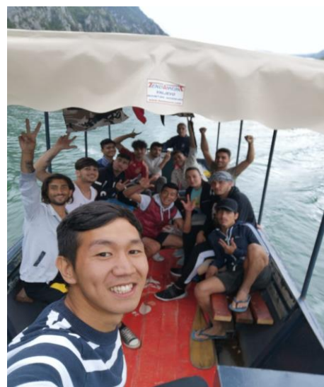
UNHCR supported participation of 10 unaccompanied and separated children in Tara National Park camping trip, ©UNHCR, August 2019

CO in Belgrade, FU in South Serbia, regular monitoring presence in five Asylum Centres and 25 other sites across the country