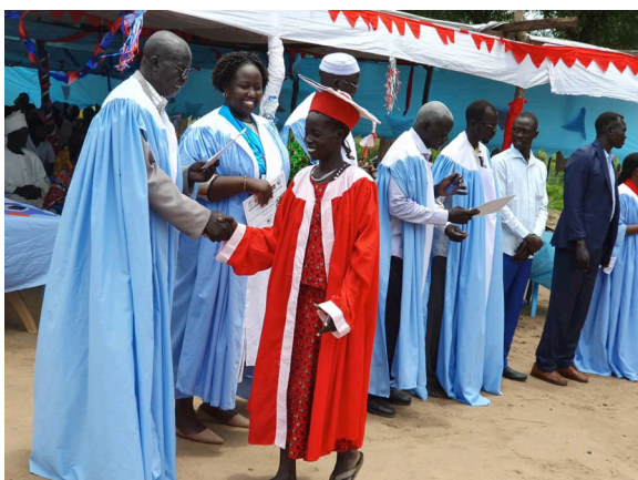
County authorities and UNHCR staff in Maban congratulate graduates of a four-month tailoring course supported by UNHCR and partner Save the Children International.

*DRC - Democratic Republic of Congo Total figure does not include 2,222 refugees and asylum seekers in the Central African Republic.