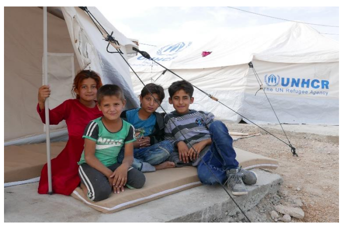
Refugee children playing outside their tent in Bardarash

Since the beginning of the emergency, two different refugee camps have been designated to host the new arrivals, namely Bardarash camp, which was re-opened, and Gawilan refugee camp, which was already operating. At the time of writing this report, the preferred destination by authorities for new arrivals is Bardarash refugee camp. As of 3 November 2019, out of the total 13,634 Syrian refugees who have entered the KR-I, 11,237 individuals are hosted in Bardarash refugee camp, and 1,483 in Gawilan refugee camp. A significant number of refugees have indicated that they have relatives across KR-I with whom they would like to reunite. In order to be able to leave camps, refugees