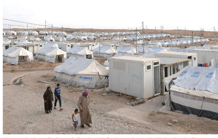
New arrivals walk through Bardarash Refugee Camp

Following recent military operations in North East Syria (NES), thousands of families have escaped their villages to seek safety in the Kurdistan Region of Iraq (KR-I). As of 3 November 2019, an estimated 13,634 Syrian refugees have crossed into Iraq. Most new arrivals are originally from Qamishli and Ras al Ain, followed by al-Malika, al-Hasakeh, and Afrin.