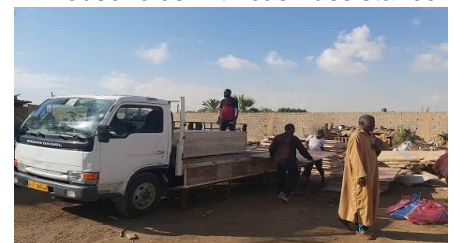
Distribution of UNHCR Shelter kits by NRC to Tawerghan IDPs in Benghazi Shebna camp.

UNHCR continues to provide assistance to internally displaced persons (IDPs) in Libya. To date in 2019, UNHCR has provided core relief items (CRIs) to more than 21,800 IDP individuals and supported over 900 IDP households with cash assistance. So far this year, UNHCR has also implemented 23 quick impact projects across Libya to support both IDPs and host communities. In eastern Libya this week, UNHCR partner, NRC distributed UNHCR shelter kits to 22 Tawerghan IDP families (86 individuals) in the Shebna IDP camp in Benghazi and a redistribution at other Benghazi Tawerghan camps to 76 families (397 individuals) who had not benefitted during an earlier distribution.