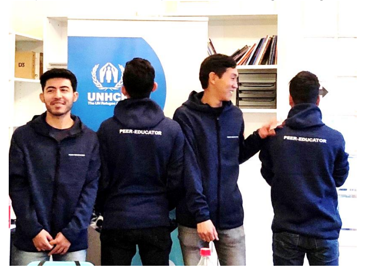
UASC peer educators, November 2019

UNHCR and partners identified and referred to Child Welfare Services 431 newly arrived unaccompanied or separated children (UASC). 329 UASC benefitted from guardianship under the UNHCR project. Seriously concerned about shortage of safe accommodation, the isolation of UASC in the remote Asylum Centre of Sjenica and their vulnerability when squatting or moving with adults and smugglers, UNHCR and partners conducted numerous Protection from Sexual Exploitation and Abuse activities in many locations and posted leaflets and posters on Zero Tolerance for Sexual Exploitation and Abuse in Arabic, Farsi and Urdu in all governmental centres. We also trained eight UASC peer educators on the risks of irregular movements and trafficking, on SGBV, gender norms and LGBTI, who immediately spread their new knowledge with many more UASC throughout the country. On 25 November, UNHCR Serbia launched the 16 Days of Activism against gender-based violence at an event organised by ADRA and partners which included personal stories of Afghan refugee women.