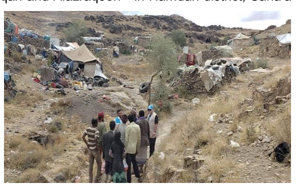
UNHCR visited two IDP sites in Hamdan district, Sana'a governorate.

governorate, currently host some 105 IDP families. UNHCR assessed the situation, with a focus on shelter and basic household items. IDPs were found to be burning materials from a nearby waste site to stay warm; as a result of which, many were found to be suffering from respiratory illnesses. UNHCR has alerted Health Cluster partners for their immediate intervention. As conditions at the two sites were found to be appalling, UNHCR will prioritize distributions of basic