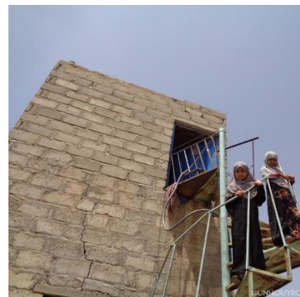
Two displaced girls stand on the staircase of their rented house in Amran. The family fled from Hajjah after the recent escalation of fighting. UNHCR assisted them with CRIs.

UNHCR's cash and shelter assistance to IDPs is on-going. On 2 April, the distribution of the second round of cash assistance for 2019 to Yemen's northern governorates was finalized, targeting 15,888 households for multi-purpose protection (10,662) and shelter needs (5,226). As of 31 March 2019, 87 per cent of targeted families had collected their assistance. Needs assessments for UNHCR-led Shelter and Site Management coordination continue. Partner NCR assessed 500 families in Houth hosting site in Amran governorate. Houth is one of the 88 sites the cluster has assessed and verified as being critical this year. In Bani Hushaysh district in Sana'a governorate, cluster partner YGUSSWP carried out an assessment of 591 IDP families and those from the extremely vulnerable host community. Emergency items will be released on 7 April to person in this group.