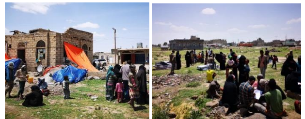
The colourful tarpaulins (orange and blue) are makeshift shelters. UNHCR with partners assessed the situation, conducted interviews and distributed CRIs/ESKs as an emergency response.

On 28 May, field office Sana'a conducted an assessment mission to Dhamar district, Dhamar governorate , directly south of Sana'a (see picture right). Three days of heavy localized rains, one week before, destroyed emergency tents and houses. Many of the IDP and host-community families are in dire need of emergency items. However, due to stock shortages, only 14 families received CRIs and three received ESKs. UNHCR's partner in the field was requested to monitor families for a follow-up distribution in the coming week as stocks are replenished.