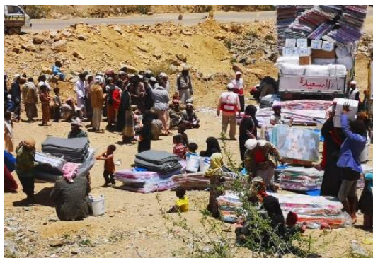
Distributions a the Huth IDP site, north of Amran governorate. This is the first time UNHCR provided assistance to this area, due to prior inaccessibility and on-going conflicts. Huth site is one of the 88 IDP sites that will be prioritized for site management services this year, following the assessment.

In the northern governorate of Amran, UNHCR through partner provided 140 IDP families with CRIs at the Huth IDP site. This is the first time that the families received CRIs as the area had been prone to continuous fighting and remained inaccessible until now. Huth IDP site is one of the most critical 88 priority IDP collective sites out of 1,340 assessed this year by the Shelter cluster. It is also one of the 16 IDP sites where UNHCR is providing protection, shelter management and coordination assistance through the Yemen Humanitarian Fund. The more central governorate of Amran has seen a constant rise in IDPs since the