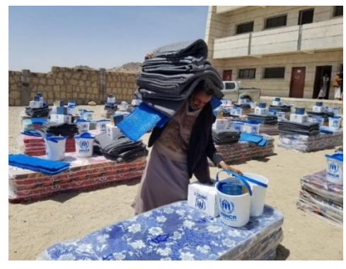
A displaced man receives basic UNHCR assistance kit Rajuzah district of Al Jawf Governorate.

Cash remains at the forefront of UNHCR's assistance in Yemen. In 2018, UNHCR assisted close to 800,000 Yemenis (and 130,000 refugees), disbursing USD 48 million. By monitoring new displacement and working with service providers, community centres and local leaders, UNHCR and its partners are able to identify and assess the needs of vulnerable households. During the reporting period, 16,753 IDP families received cash assistance to address their protection needs, including rental subsidies. Distributions were made in the northern border areas of Sa'ada and Al Jawf (3,552 families), to families at the flash point of