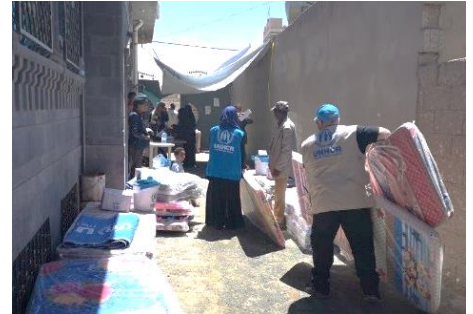
UNHCR staff help distribute mattresses, blankets, buckets and other CRIs to displaced people in Dhamar governorate.

On 8 March, 139 Somali refugees departed Aden for Berbera, Somalia. This is the twenty-ninth departure by boat for the Assisted Spontaneous Return programme (ASR) since 2017 and the third this year. An estimated 5,000 Somali refugees have departed Yemen in 2019 so far. A total of 48 Somali refugees approached the Return Help Desk in Basateen and Mukalla registration centres for counselling and voluntary return related information.