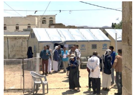
UNHCR Field Office Sana'a donated four RHUs to the Kharif hospital, Amran governorate

UNHCR alongside partner YRC, local officials and the National Authority for the Management and Coordination of Humanitarian Affairs, opened new buildings at Kharif hospital, Amran governorate. The facility is rurally situated and provides medical support to some 70,000 IDPs and the host community. UNHCR, in recognizing the increased needs of the hospital, donated four Refugee Housing Units (RHU), effectively doubling the hospital's capacity. Immediately upon installation, the RHUs became operational as consultancy rooms and emergency treatment rooms for minor operations. UNHCR in Sana'a is installing 23 RHUs at 14 locations in Amran, Sana'a, Dhaher and Amanat Al Asimah governorates for diverse purposes such as classrooms, waiting areas, community centres and hospital rooms, which will benefit thousands of people from both displaced and host communities.