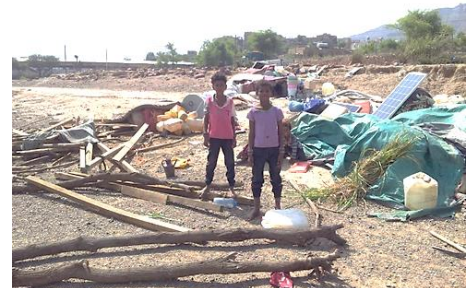
Two boys stand in the open area of Ash Shamayatayn district, Taizz governorate in front of belongings they were able to carry.

UNHCR and partners are following up on reports that some 400 families have fled from Al Bireen area, Al Ma'afar district in Taizz governorate, to the neighbouring district of Ash Shamayatayn. According to IOM Rapid Displacement Tracking, this represents more than ten percent of the entire displaced population from Taizz (4,184 households), since the beginning of 2019. While conducting verification on the numbers of displaced families, UNHCR, together with Cluster partners, is responding by providing food, water and emergency shelter.