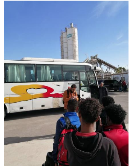
Individuals previously hosted at the GDF continue to transfer to the urban community. Currently the GDF hosts over 1,000 individuals.

UNHCR's assistance to internally displaced persons (IDPs) across Libya is ongoing. As of 23 December, UNHCR has distributed CRIs to more than 22,000 IDPs and returnees while a total of 921 have received cash assistance. UNHCR has also distributed shelter kits to more than 12,700 IDPs and returnees in Tripoli, Nafusa mountains and eastern Libya. This week UNHCR's partner NRC distributed shelter kits in Derna city to 865 families (4,916 individuals) who received 1,260 kits. With this distribution, the entire stock of UNHCR shelter kits in East Libya (4,000) is concluded.