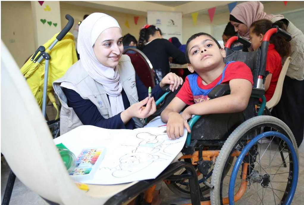
Awareness activity: an awareness session for Persons with Disabilities (PWD) and members of their families.

These networks help to provide a timely response in a critical time as well. For instance, the CSCs' networks are the most reliable and effective mechanism to identify the affected families in winter-time emergencies. Finally, the independence that is given to CSCs in the engagement process makes them more responsive and innovative, as they are able to plan and implement the activities more independently and equally, in consideration of the communities' needs.