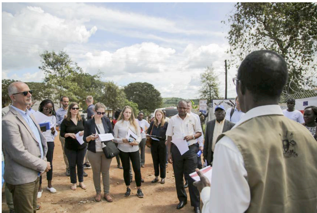
Ugandan doctor briefs visiting Ambassadors and diplomats about health care services for refugees and host communities at Bujubuli Health Centre III in Kyaka II refugee settlement, Kyegegwa district.