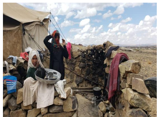
Field Office Sana'a visited IDP sites in Hamdan district, Sana'a governorate. Many of the families were already resorting to burning plastic to keep warm, and as a result, suffering from respiratory diseases.