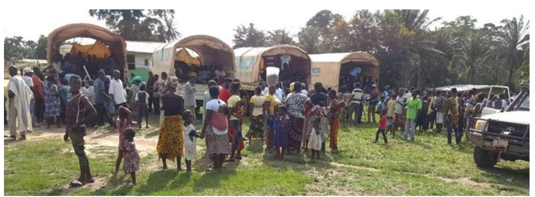
Ivorian refugees in PTP Settlement get on the convoys to return home.