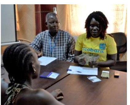
Urban refugees in Monrovia (Montserrado) also received their seed capital aimed to improve their income generating activities (IGAs).