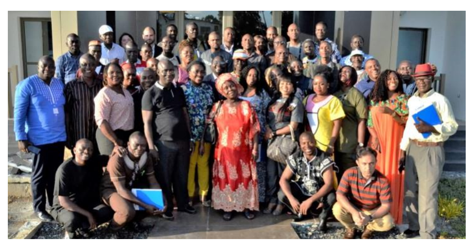
Participants to the stakeholders meeting in November 2019 included LRRRC; AIRD; Ivorian refugees; Liberian host community members from Nimba, Grand Gedeh and Maryland counties; ministries of Internal Affairs, Education, Health, Finance and Development Planning (MFDP), Justice, Liberian Immigration Service; the Resident Coordinator Office and UN Agencies (UNDP, WFP, UNIDO and IOM).