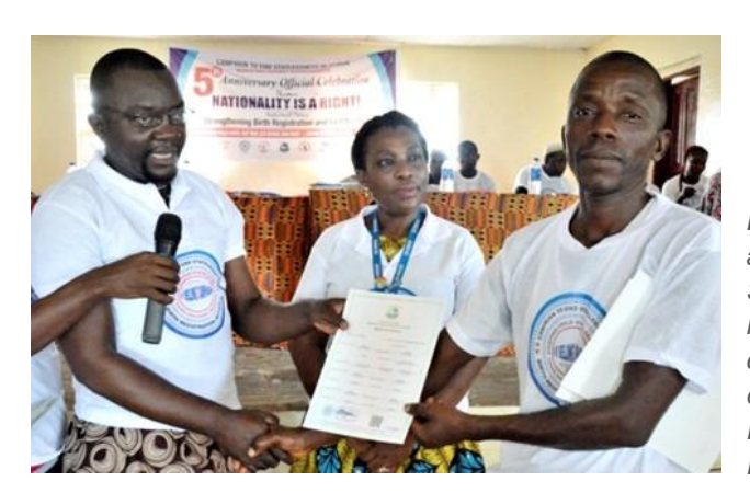
LRRRC Executive Director (L) and UNHCR Senior Durable Solutions Officer (centre) handed over several birth certificates, provided with the direct support of Church Aid.

On 4 November 2019, UNHCR and LRRRC joined Church Aid Inc. in the celebration of the IBelong Campaign mid-point in Klay Town (Bomi County). The indoor programme included the handing over of several birth certificates.