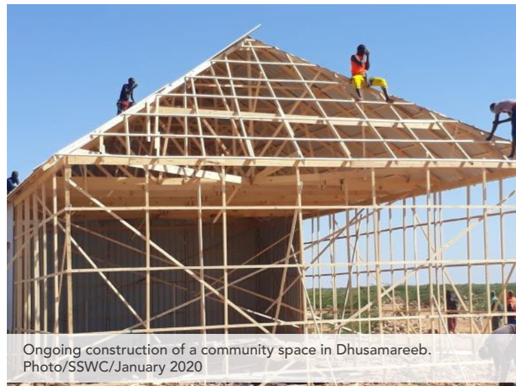
Ongoing construction of a community space in Dhusamareeb.January 2020

CCCM teams supported HLP partners in Baidoa to finalize an eviction risk mapping. It was noted that 342 settlements have written agreements and 65 settlements out of the 431 settlements are communal owned sites with permanent land tenure. 111 settlements are eviction prone sites with tenure agreement of less than one year