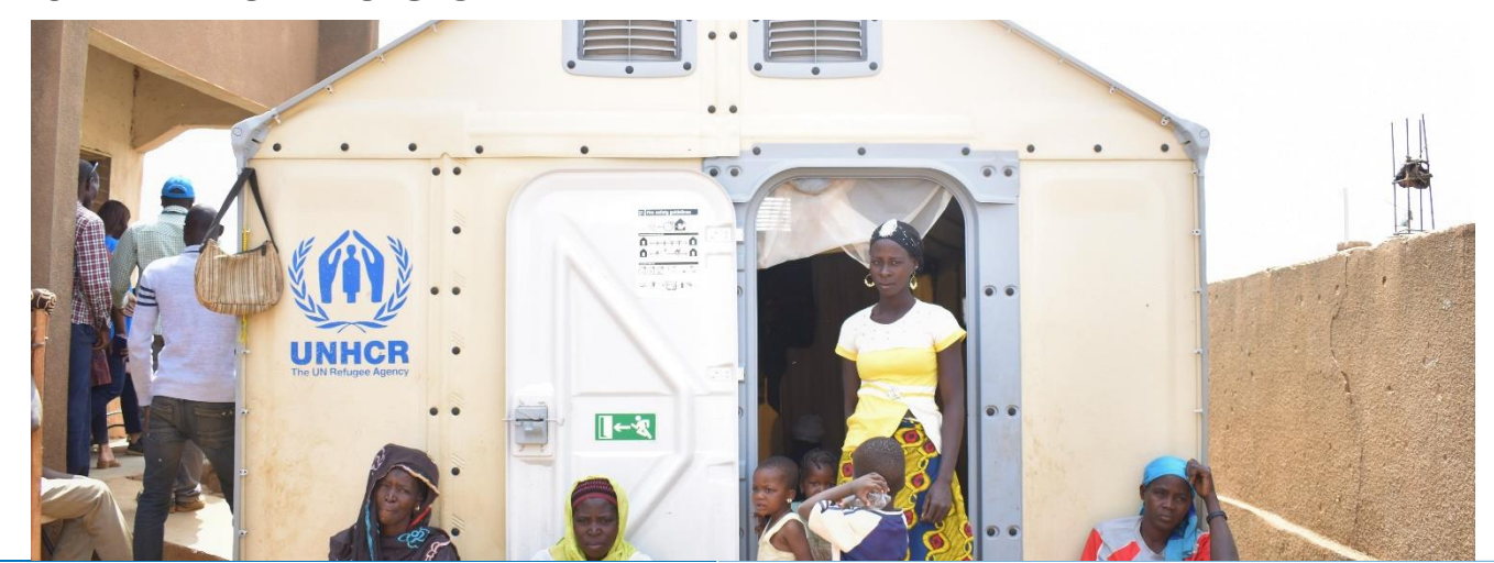
Displaced families provided with shelter in Centre-Nord region