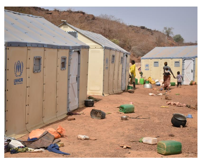
RHUs constructed in Kaya to host IDPs newly arrived from Pensa, following recent attacks that killed 9 civilians.

30 community workers, and 08 Government agents were trained from 24 - 26 February