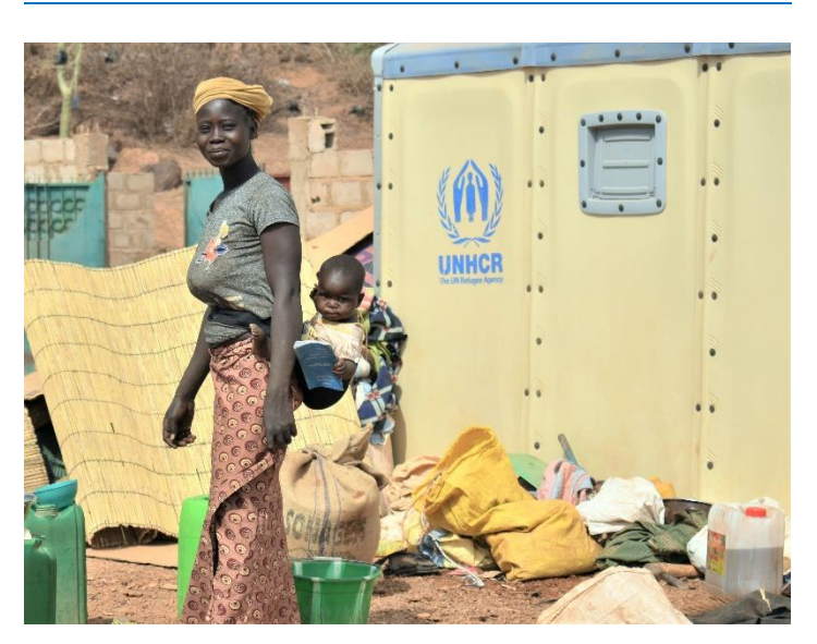
An internally displaced woman with her baby in the Bissinogo IDP hosting site in Kaya

of IDPs still need Identity Documentation to enjoy their fundamental human rights.