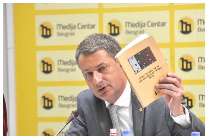
Presentation of "Right to Asylum in the Republic of Serbia" Annual Report for 2019, 27 February 2020

CO in Belgrade and FU in South Serbia for regular protection monitoring in five Asylum Centres and 25 other sites across the country