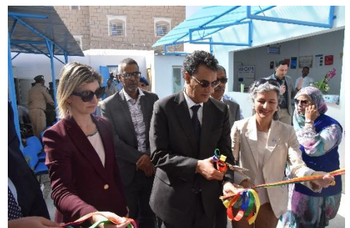
The Waly (Governor) of Nouadhibou, IOM and UNHCR Representatives cut the ribbon of the new joint office

In February, UNHCR and IOM inaugurated a new joint office in Nouadhibou, on the northern shore of Mauritania. The government and several consular delegations and international actors attended the inauguration. Last year, UNHCR had conducted a study on migrants and refugees in the city of Nouadhibou which made it possible to better estimate the refugee population (about 10,000) and offered the basis for designing UNHCR's additional protection interventions. In 2020, UNHCR will begin registering Malian asylum seekers in Nouadhibou.