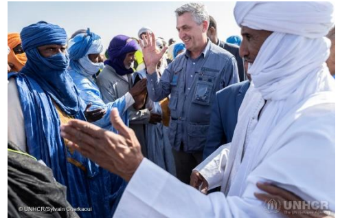
UNHCR High Commissioner meets with Malian refugees in Mbera camp

In Nouakchott, the High Commissioner met with the Prime Minister, as well as the ministers of health, interior and defence. During the meetings, he congratulated Mauritania for its welcoming stance towards refugees, and for its pledges at the Global Refugee Forum to include refugees into its national health system, despite its own challenges. He also met with the UN partners and donors to discuss the cooperation regarding the provision of support to refugees in Mauritania. The High Commissioner also went to Mbera refugee camp, fifty km from the border with Mali, where he was warmly welcomed by the local authorities and refugees. He exchanged with them on their needs, while visiting the registration centre, a vocational training centre run by the ILO in collaboration with UNHCR, and the health centre in Bassikounou.