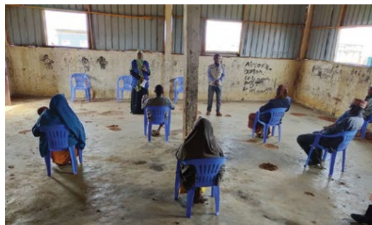
COVID-19 information sharing campaigns in Baidoa, Bay Region.

The CCCM partner trained 45 Camp Management Committee members on the HLP in Luuq. The purpose of the training was to ensure the CMCs are aware of the land tenure issues, properly map and refer sites at risk of eviction to the HLP actors.