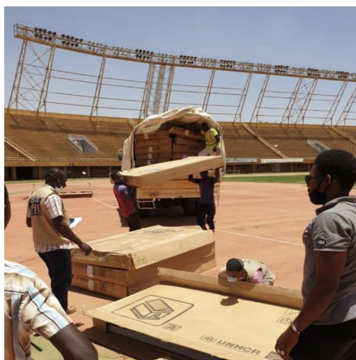
Arrival of Refugee Housing Units in the national stadium to help the Government set up a COVID-19 transit center