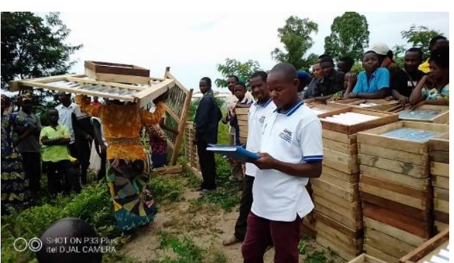
Distribution of shelter construction materials in Kazimia, Uvira Territory, South Kivu Province.

total of 198 displaced and returned women with specific needs received professional trainings in tailoring, cooking, baking, and soap-making. All received start-up kits at the end of the project, to start their own businesses.