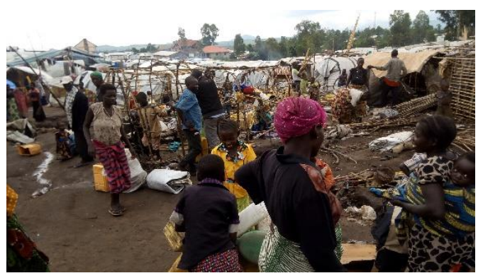
Residents of the General Hospital displacement site, in Bunia, packing up to prepare their transfer to the new Kigonze site.

In Kigonze site, UNHCR and partner Caritas launched a community-based complaint referral mechanism to help prevent sexual exploitation and abuse and ensure accountability towards beneficiaries; complaint boxes were installed, and focal points elected amongst IDPs, to facilitate the feedback mechanism and raise awareness.