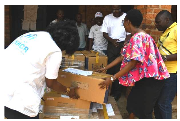
UNHCR hands over medicines to health zones in Nord Ubangi Province.

healthcare for both Central African refugees living outside of camps and for the local population. Access to quality healthcare is usually challenging in these remote locations due to bad road conditions and a lack of funds for UNHCR to address needs.