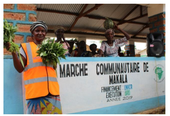
A community market building handed over by UNHCR in a return village in Tanganyika Province.

From 24 to 29 February, UNHCR, partners and provincial authorities launched an awareness-raising campaign on voluntary return in the displacement sites of Kankomba TzF, Kankomba Office and Kaseke, in and around Kalemie in Tanganyika Province. Since August 2019, provincial authorities decided to gradually close the 14 IDPs sites around Kalemie. UNHCR is therefore providing return assistance to IDPs