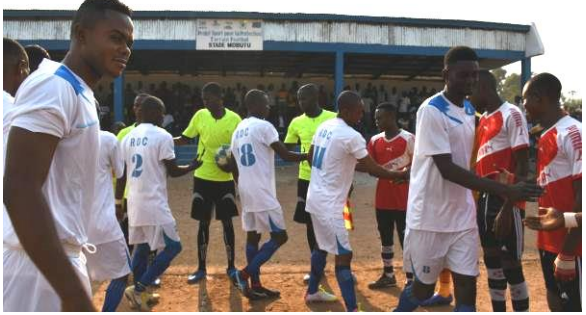
Teams warm up for a football game at the Stade Mobutu, Gbadolite. UNHCR's partner AIRD constructed the seating area and helped rehabilitating the pitch.