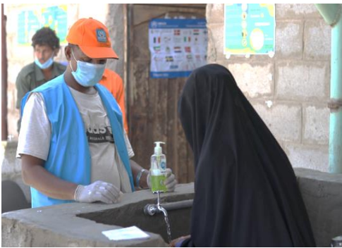
A staff briefs a refugee woman on handwashing at a recent hygiene item distribution that took place in Kharaz Refugee Camp. Social distancing and regular hand washing was communicated to all persons. © UNHCR/YPN, March 2020

Due to COVID-19 precautionary measures, all refugee status determination and resettlement interviews have been suspended until further notice. All current cases have been