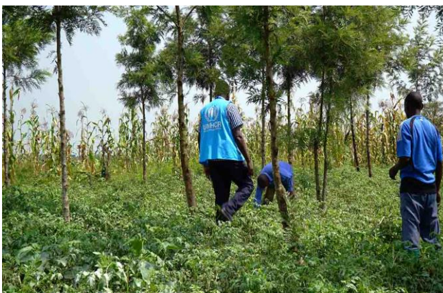
UNHCR promotes agroforestry practices across all settlements in Uganda, as portrayed by the one in in Rwamanja refugee settlement.