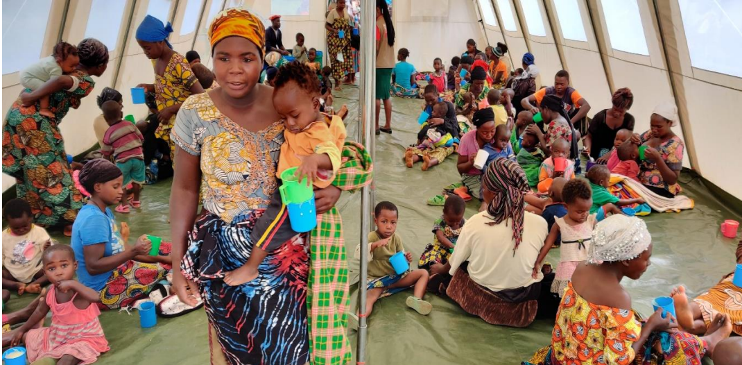
Children aged 6 - 59 months, receive Blanket Supplementary Feeding at Nyakabande Transit Centre, Kisoro district, in early 2020.