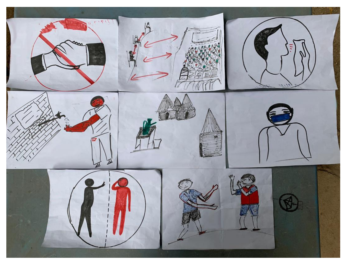
The finalists of a children's COVID-19 awareness drawing contest in Malakal POC. The contest was developed to encourage engagement with the messaging. The drawings will be used during awareness raising activities.

COVID-19 Update #6 21 May - 05 June 2020