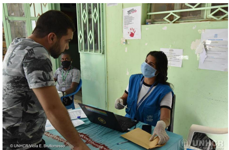
A UNHCR staff member delivering cash assistance for social protection to a refugee in Nouakchott in May 2020

1 Branch office located in Nouakchott 1 Sub office in Bassikounou 1 Field unit in Nouadhibou