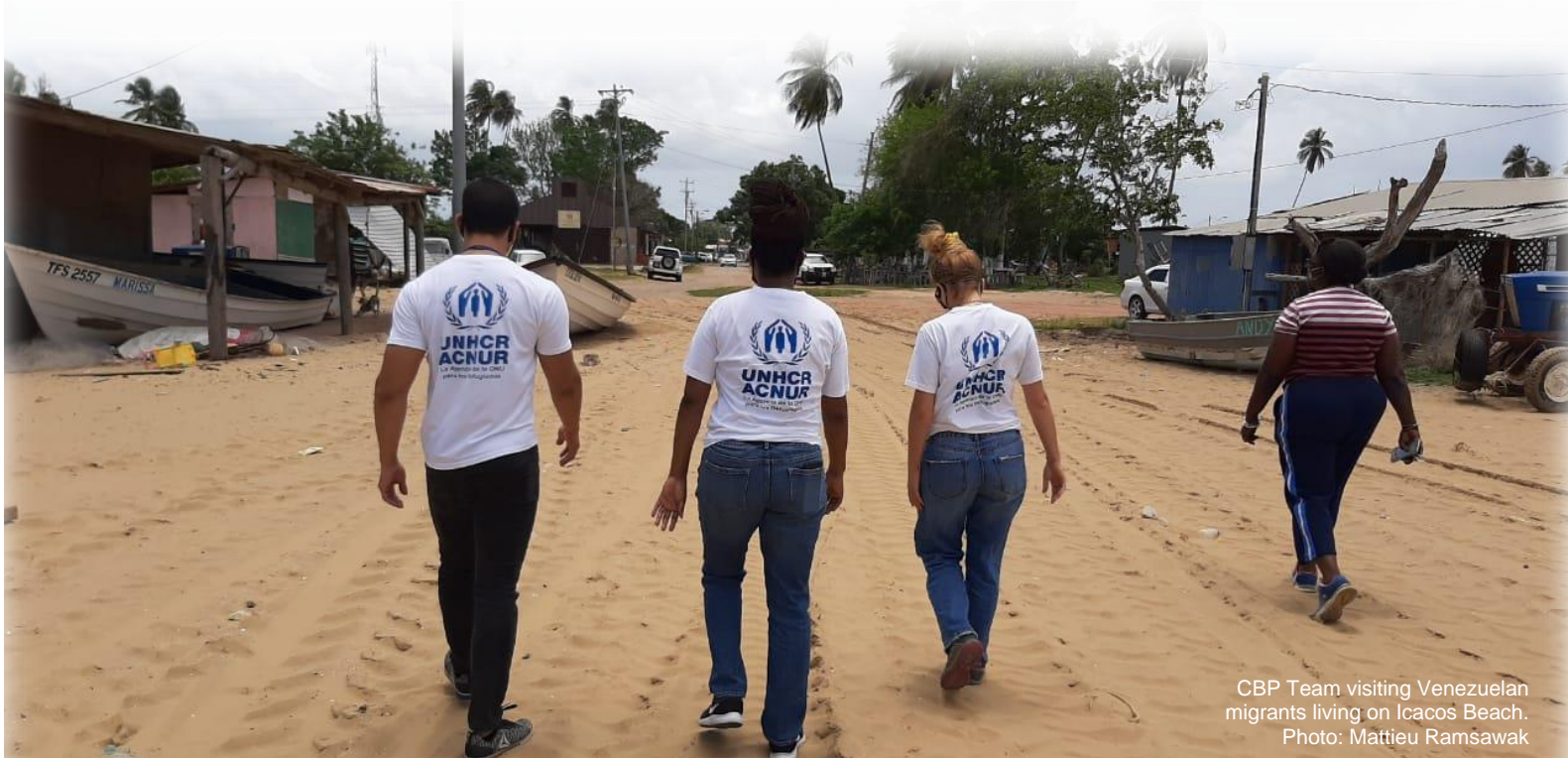
CBP Team visiting Venezuelan migrants living on Icacos Beach.

MISSION TO ICACOS. The UNHCR T&T Community-Based Protection (CBP) team conducted a protection assessment mission of three groups of Venezuelans living in the Icacos area on May 13, 2020. This was the second mission to the community by UNHCR as one was previously undertaken in December 2019. Approximately 100 persons in total live in all three locations with half of these being children and close to one third being women. The groups faced issues of inadequate access to potable water, inadequate access to quality sanitation, lack of access to education, overcrowding, unhygienic living conditions and poor access to social and health services due to their location, including testing for COVID-19. The CBP team is coordinating a protection response with officials from the Ministry of Health and will meet with the local government authorities as well as other agencies and community-based organisations operating in the area, to understand the relationship between the host community and the Venezuelans and to develop beneficial community-led solutions for the migrants.