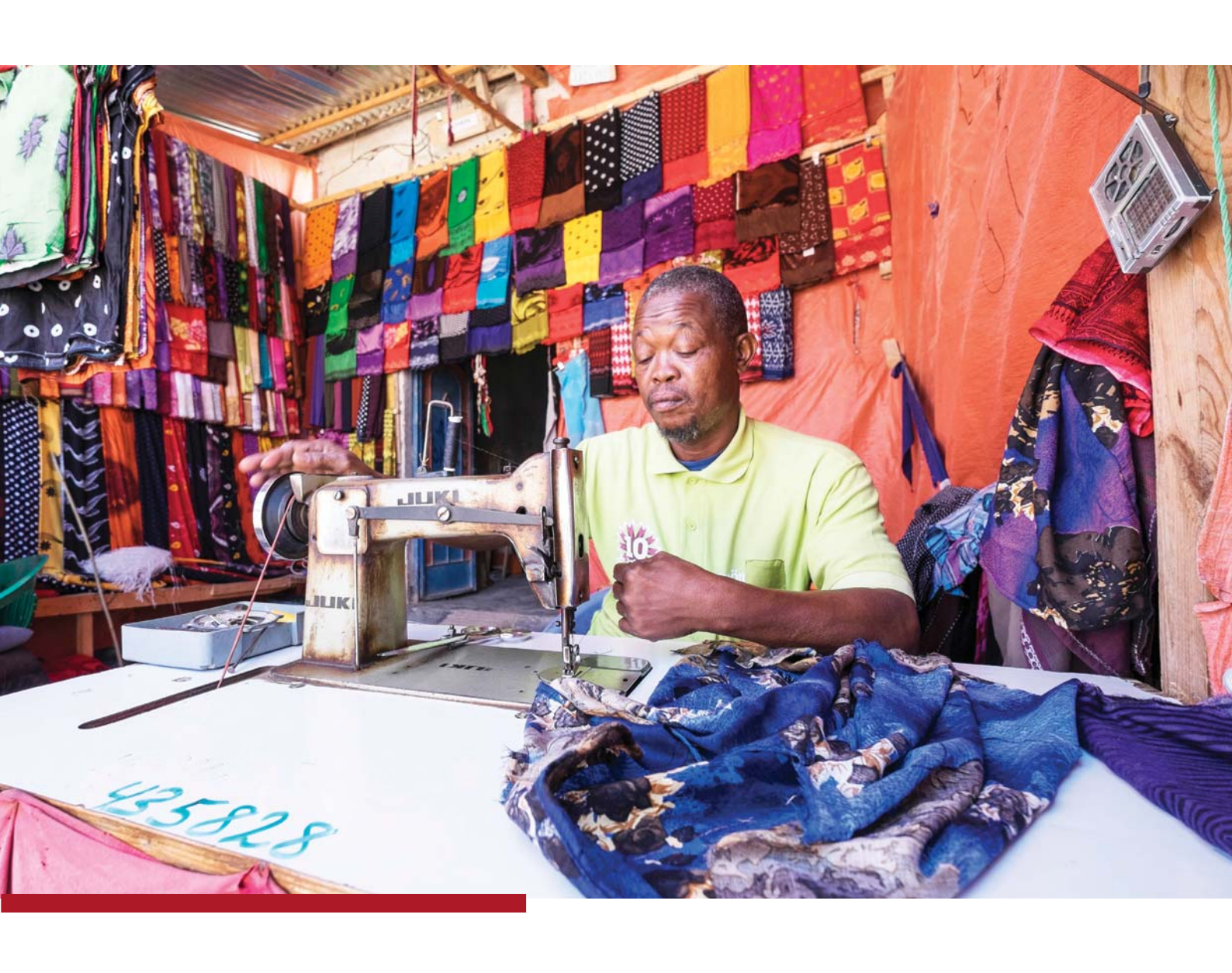
Local market in Garowe, Puntland, Somalia.