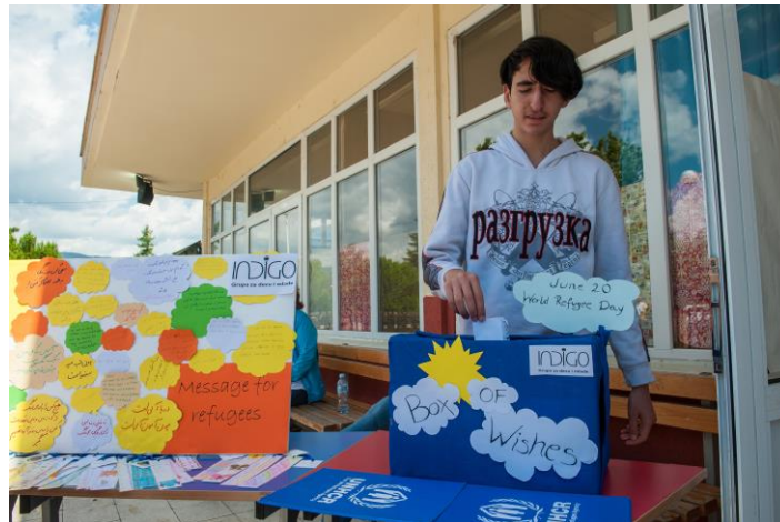
World Refugee Day workshop at Vranje Reception Centre

A young refugee from Syria tragically drowned in Ada lake. A small demonstration demanded the removal of migrants from Banja Koviljača. UNHCR project lawyers helped four refugees to file charges related to criminal offenses committed against them, including a privately accommodated refugee family that had been brutally threatened and attacked by a local neighbour. Upon request of BCHR, the Media Council instructed media to remove hate-speech comments against refugees from five portals.