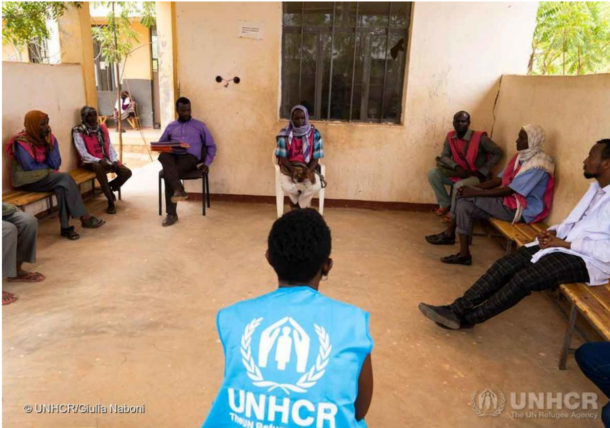
UNHCR staff deliver a COVID-19 orientation session to Somali refugee healthcare workers and Community Outreach Workers at Kobe camp, Ethiopia