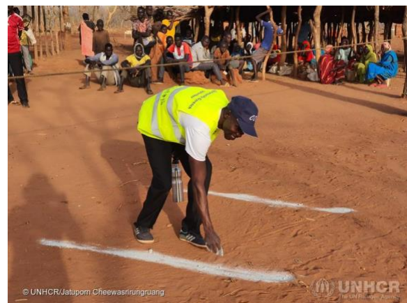
A Sudanese refugee community outreach volunteer sprinkles chalk to mark appropriate physical distancing spots during a food distribution at Pamir camp in Jamjang, north-east South Sudan.

In Bangladesh , imams are a trusted community leadership structure and play a key role in sensitizing their communities on various issues. To respond to COVID-19, imams have been mobilized across camps in Cox's Bazar, to disseminate accurate information on COVID-19 prevention.