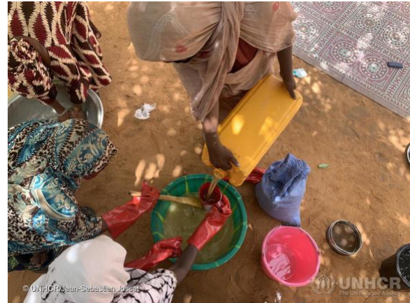
Tuareg refugee women from Mali make soap to sell in their neighbourhood in Niamey. After mixing vegetable oils, water, sea salt and bicarbonate soda, they pour the mixture into moulds and leave it to dry for a week

handwashing soap, while a DAFI student (Albert Einstein German Academic Refugee Initiative, UNHCR's higher education scholarship programme) is both producing soap and sewing masks for distribution in camps. In camps in Jordan, Syrian refugee women who have been trained by UNHCR, are also making and distributing soap to their local community.