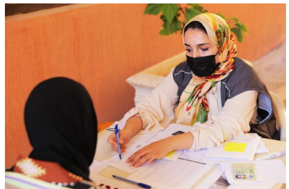
Provision of pre-paid cards for IDPs in Tripoli.

On 27 July, UNHCR through its partner, Danish Refugee Council, started a round of cash assistance distribution for IDPs in Tripoli. This week, more than 300 displaced families were due to receive pre-paid cash cards that can be used to buy basic necessities. A total of 500 displaced families will be targeted in both Tripoli and Yefren (Nafusa Mountains) by the end of the round. So far in 2020, a total of 3,494 IDPs were provided with cash assistance in Libya.