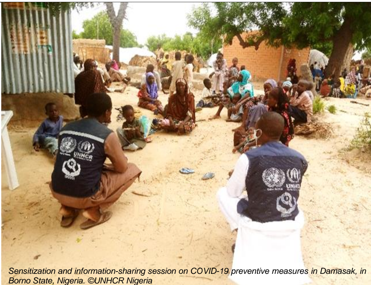
Sensitization and information-sharing session on COVID-19 preventive measures in Damasak, in Borno State, Nigeria.