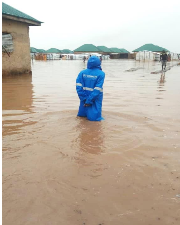
Flood in the Gubio Road Camp, in Borno State, Nigeria.