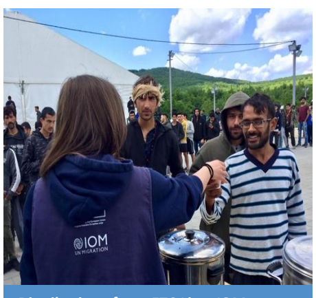
Distribution of tea, ETC Lipa, IOM

In the reporting period, a WiFi network was installed in TRC Miral , thus, the Internet connection is now available to the entire population of the center. In TRC Sedra , the works on the installation of sanitary containers were completed, and a fence, including the gate,