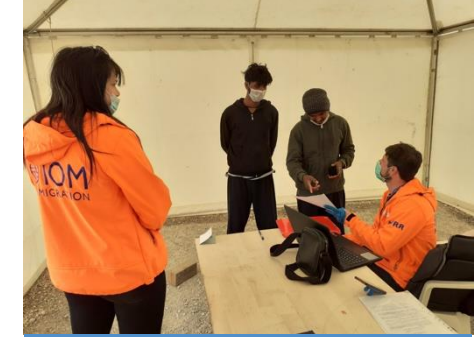
IOM AVRR Counselors, TRC Usivak

UNFPA has been coordinating relevant authorities and humanitarian response partners by leading the GBV WG in USC in the reporting period where a joint discussion took place related to updates from the field in provision of support to GBV survivors and update of GBV referral pathways. Some of the issues related to GBV that were underlined by relevant actors included an increased