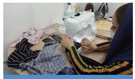
"All for All" activity sewing clothes, UNHCR/BHWI