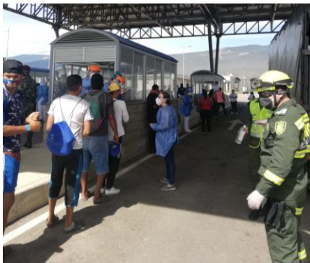
Screening processes for the refugee and migrant population at the point of entry in Villa del Rosario.

In July, more than 68,300 beneficiaries received one or more types of health assistance through 62 RMRP direct and implementing partners, in 263 municipalities of 29 departments throughout the national territory.