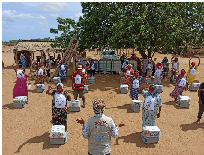
In Uribe, La Guajira, more than 80 refugee, migrant, returnee, and Yotojoroin community families received family hygiene kits and guidance on home-based handwashing solutions.

Over 26,700 people benefitted from daily access to water and sanitation services at service delivery points such as health centers, shelters, food distribution points, schools, including more than 2,700 children and adolescents who accessed these services in learning and child development spaces. Finally, more than 9,500 people received water and sanitation services at the community and institutional level.