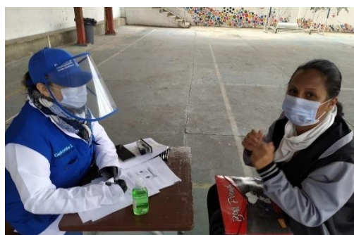
Delivery of multipurpose cash and guidance on monetary transfers to refugees and migrants, especially to heads of households, in the municipality of Pamplona in Norte de Santander.

During the month of July, more than 68,100 beneficiaries received one or more types of support through 18 RMRP direct and implementing partners, in 68 municipalities of 17 departments.