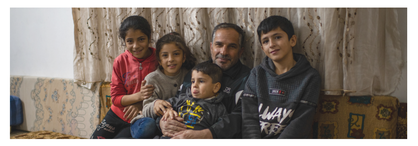
A Syrian refugee family fled their home in Daraa, Syria, in 2012 and now lives in Jebel Hussein, Amman. With winter approaching, the family will rely on UNHCR cash assistance. "Winter cash assistance is so important. It helps my family a lot. It will mean I can bring gas or a heater. Even though I have other needs and rent that need paying, I know this winter the basic thing I need to do is keep my children warm. I don't have a heater at the moment. The one we had last year broke, so it needs replacing. If we don't receive the winter cash assistance it will be a disaster."

As there are few avenues for support available to non-Syrian refugees, it is unlikely that another organisation will be in the position to assist those that UNHCR cannot support due to a lack of funding, leaving 45,000 vulnerable Iraqi refugees and refugees of other nationalities (15,000 families) without any means of assistance during the winter season.