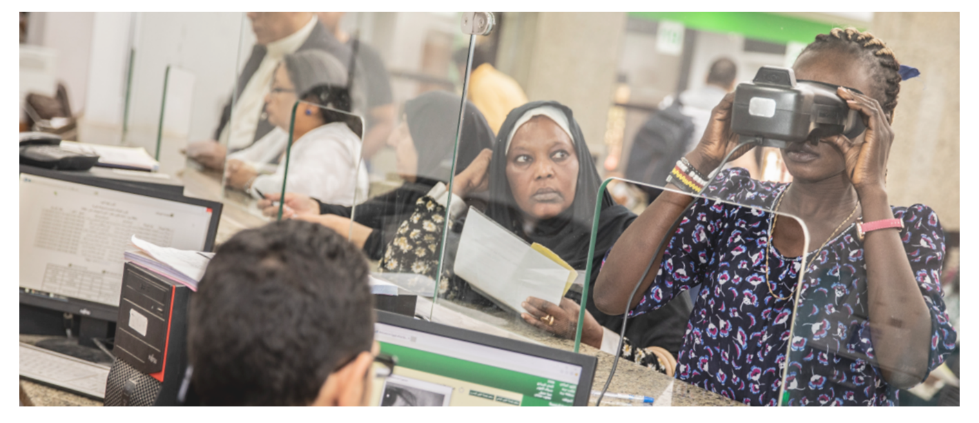
A Sudanese refugee gets her UNHCR cash assistance in a Post Office in Cairo after being identified by iris scanning system.

The required funds will cover the needs 85,500 Syrian refugees (28,600 families), 4,033 Iraqi refugees (2,132 families), and 91,200 refugees of other nationalities (48,000 families). Failure to provide winter assistance will impair the ability of vulnerable households to cope with lower temperatures resulting in high risk of harm to their physical and psychological well-being and/or causing them to resort to other harmful coping strategies. They may also resort to redirecting their already meagre income to address the winter elements that otherwise would be used to cover for basic needs, rent. education and other essential needs.