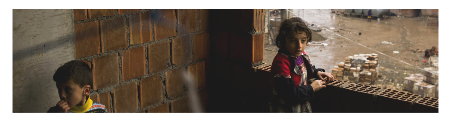
Two young IDPs stand at a damaged balcony in a building in Daben city, a housing estate with five buildings. Residents face multiple dangers including the cold, falling from floors or staircases or being hit by debris. There are 1.4 million IDPs in Iraq since January 2014, as well as 4.7 million returnees as of 30 June 2020.

In some mountainous areas of Iraq, especially in the Kurdistan region where 99 per cent of Syrian refugees reside, temperatures can drop to below freezing during winter months. The majority of people rely heavily on winterization assistance, which addresses the basic needs of IDPs and refugees to survive through the severe winter conditions. The COVID-19 pandemic has further exacerbated the living conditions of persons of concern, heightening their protection risks and socioeconomic situation.